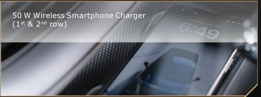
50 W Wireless Smartphone Charger (1 st & 2 nd row)