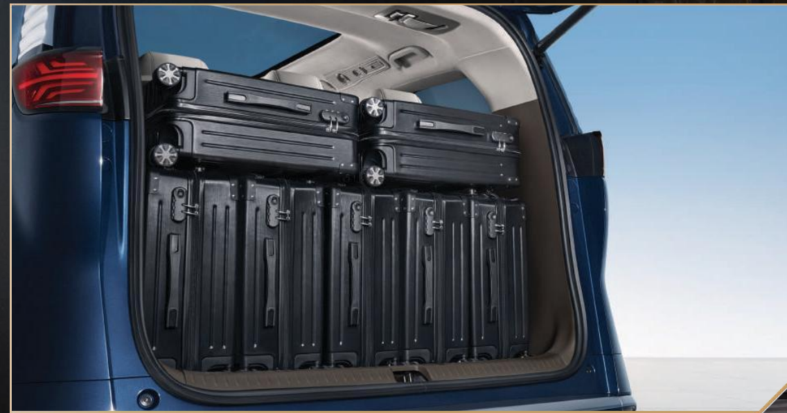
Electric Trunk with Position Memory and Anti Pinch

The enormous 410L to 570L trunk (fits up to 7 large suitcases) can accommodate any lifestyle need. With enough room for a large air bed, the DENZA D9 takes luxury road trips to the next level.