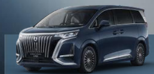
Whale Sea Blue