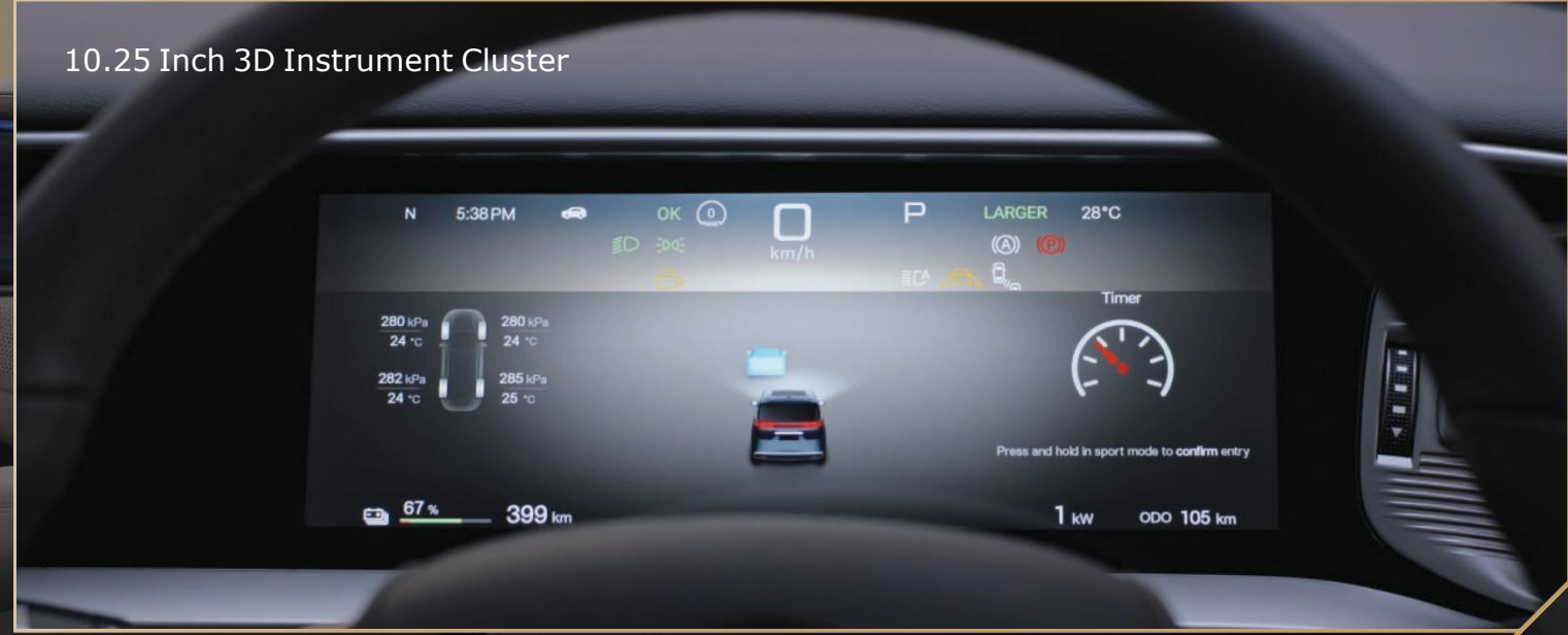
10.25 Inch 3D Instrument Cluster